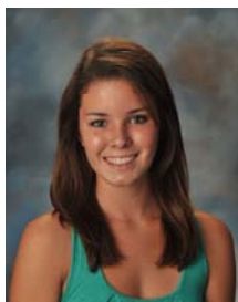
Peyton Williams Girls' Volleyball