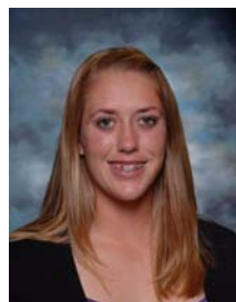
Holland McNabb Girls' Waterpolo